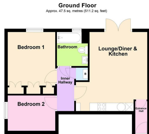
Total area: approx. 47.5 sq. metres (511.2 sq. feet)